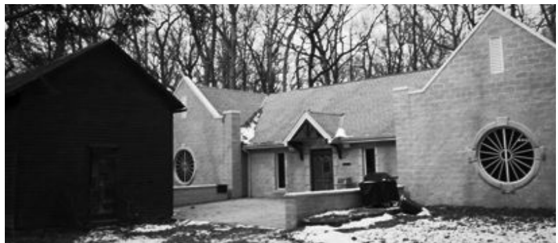
At left, the original ADEL Lodge at Kenyon, the oldest fraternity structure in North America (1860) alongside the new Ganter Price Hall, constructed in 2003.