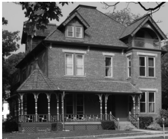
The Miami Chapter House