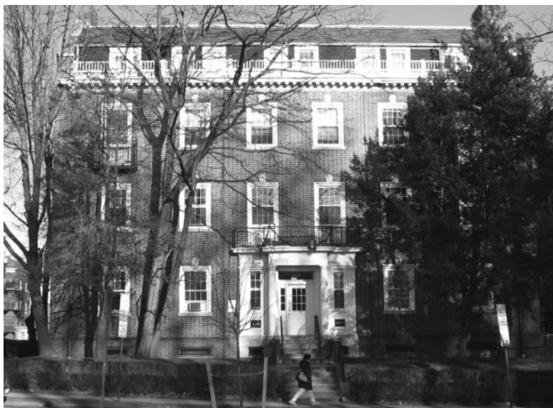
The Johns Hopkins Chapter House

apartments configured as two-bedroom units; all the units have balconies, and several have terraces overlooking the campus as well. As used by the chapter, the building can accommodate 56 undergrads; the house includes a two-bedroom unit that is occupied by the chapter’s first housemother, features a small presidential suite and has a still-to-be-renovated suite reserved for visiting alumni. The undergraduate brothers converted one of the storage rooms in the basement into a bar and dance floor. The basement also contains a secure room that serves as an archive for the chapter. A three-bedroom unit on the second floor is being converted into a brother’s suite (television lounge, billiards room and computer room / library). The building’s ballroom, complete with marble fireplace and original paneling, is being converted into a formal chapter room.